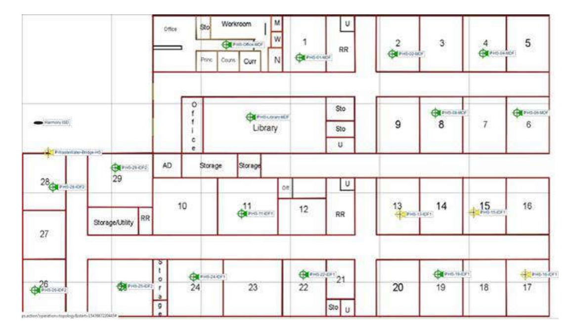
High School - Need AP's in 3, 5, 7, 9, 10, 12, 14, 16, 18, 20, 21, 23, 27